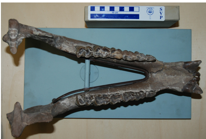
Figure 1. Mandible of the Oligocene rhinocerotid Epiaceratherium magnum Uhlig, 1999, from Rheinbetts, Switzerland (NMB.O.B.928). Scale bar = 10 cm.

The 3D models presented here have been described by Tissier et al. (in prep.). The mandible NMB.O.B.928 (Figure 1 and Table 1) assigned to Epiaceratherium magnum Uhlig, 1999 is housed in the Naturhistorisches Museum Basel (Switzerland). This is the most complete remain known to date attributed to this otherwise poorly known species. It notably shares the absence of third lower incisor and lower canine, the absence of lingual cingulum on the lower premolars and the usually-closed posterior valley on p2 with other species of the genus, i.e. E. bolcense Abel, 1910 and E. naduongense Böhme et al., 2013.