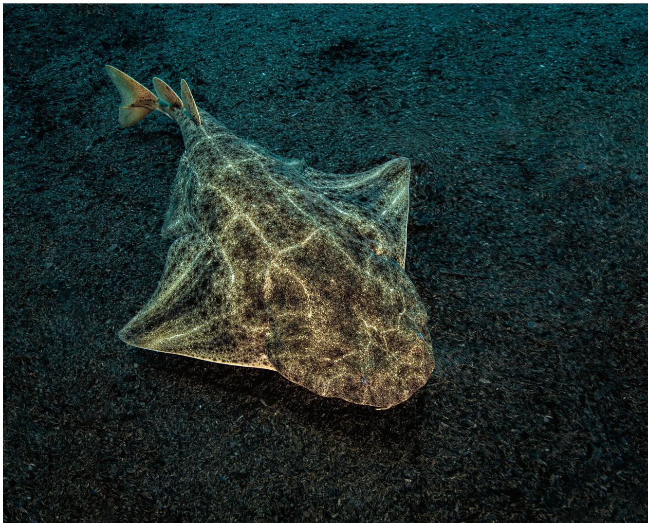
FIGURE 1 The angelshark ( Squatina squatina ). This individual was observed by the diver Laurent Ballesta at a depth of 40 m on the eastern coast of Corsica near Biguglia, south Bastia, in June 2020.

Resource Coordinators, 2016) was conducted for S. squatina and its two sympatric species ( S. aculeata and S. oculata ). Cytochrome c oxidase subunit I (COI) and 16S sequences were available for all three Squatina species, and 12S sequences (from three complete mitochondrial genomes) were available for S. squatina only. These sequences were extracted from NCBI and aligned using Geneious Prime 2021.0.3 to identify a primer pair and a probe to target a barcode for S. aculeata , S. oculata , and S. squatina . The probe and primers were designed using this software following the criteria set out in the protocol of Klymus et al. (2020) (see Appendix S3). This resulted in the following forward and reverse primer pair and probe targeting a 173-bp (with primers excluded) barcode of the COI region within the mitogenome of S. aculeata , S. oculata , and S. squatina :