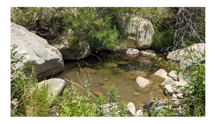
PHOTO 1 An isolated pool containing O. mykiss where a data logger was installed to monitor temperature