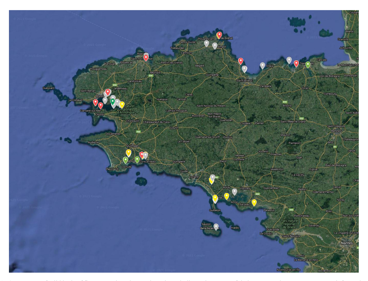
Fig. 2. Occurrence of wild beds of flat oysters in Brittany, the colours indicate the stages of their conservation status. For more information, see Pouvreau et al. (2021b).

management measures or relevant husbandry practices allowing producers to decrease the development of these diseases can be adopted to mitigate their impact on flat oyster populations once present in a zone. For example, using suspension culture, decreasing stocking densities and co-cultivation of C. gigas and O. edulis have all been shown to decrease the development of these parasites (Tigé et al., 1984; Grizel, 1985; Le Bec et al., 1991; Lama and Montes, 1993). Farming flat oysters in deeper waters has also been shown to decrease the transmission of M. refringens (Hussenot et al., 2014).