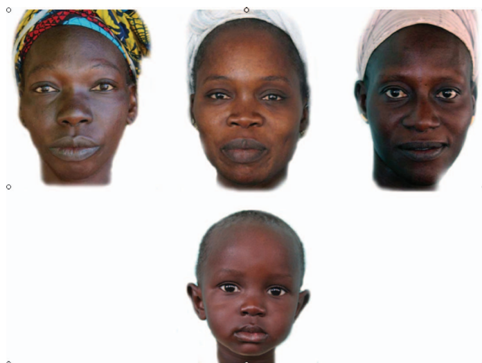
Figure 1. Example of facial recognition test using pictures of mother–child pairs from Senegalese families. Judges from both France and Senegal were asked to (1) look at the face of the child presented below and to (2) choose which picture was most likely to portray its mother among the pictures proposed above. The order of children, the position of correct mothers, as well as the choice of false mothers were randomized. Each picture was seen only once by a given judge. Here, the correct choice is the middle picture.

To assess parent–child facial similarities, the general procedure described in Alvergne et al. (2007) was used. Resemblance was assessed by asking judges to identify the true parent among a set of three adults of the same sex (Figure 1). The other two adults presented, in addition to the true parent, were randomly selected among parents of children who were not examined by a given judge. For each child, the resemblance to the father and the mother