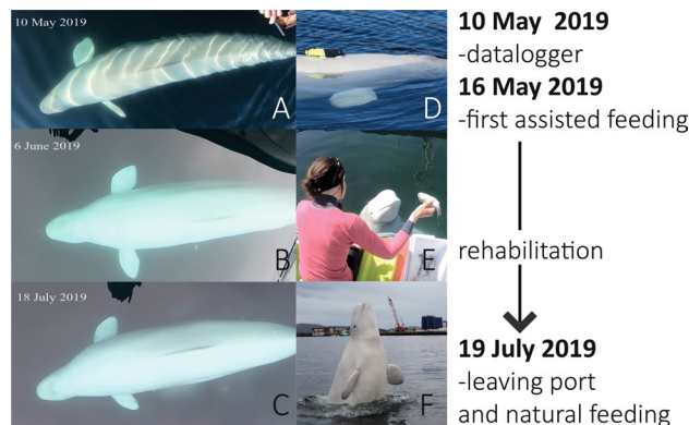
Figure 1. Pictures of beluga whale ‘Hvaldimir’ in summer 2019; (A–C) Photos show observations of his body condition when at Hammerfest between May and July 2019; (D) with the back-mounted, suction cup attached GoPro video camera used to record foraging behavior; (E) being hand-fed herring during a routine feeding session; and (F) in the harbor of Hammerfest, northern Norway, in July 2019, playful and seeking human contact.

From May 16th, the whale was cautiously fed with 5–7 kg of frozen-thawed Atlantic herring ( Clupea harengus ) throughout four to six daily feeding sessions. Gradually, his food intake was increased to 15–20 kg a day. Within just a few days, Hvaldimir displayed higher levels of energy. He spent less time logging by the dock, and started using the entire harbor area (~0.7 km 2 ). Continued monitoring using a 4 K camera (GoPro Hero 4 Black edition) attached with suction cups (without motion sensors) further revealed the whale attempting to capture live fish on multiple occasions outside of the assisted feeding sessions (E.J. pers. comm.). Following an apparent improvement in physical activity, and after signs of foraging were observed, a reduced and variable daily food-provisioning program was initiated with the hope to encourage natural foraging and Hvaldimir’s autonomy in feeding. In parallel, fecal samples were collected opportunistically for dietary analysis. Over time, based on visual assessment, Hvaldimir’s body condition appeared more robust (Fig. 1A–C), though this could not be quantified because the whale movements during encounters did not allow the team to take detailed measurements of his body.