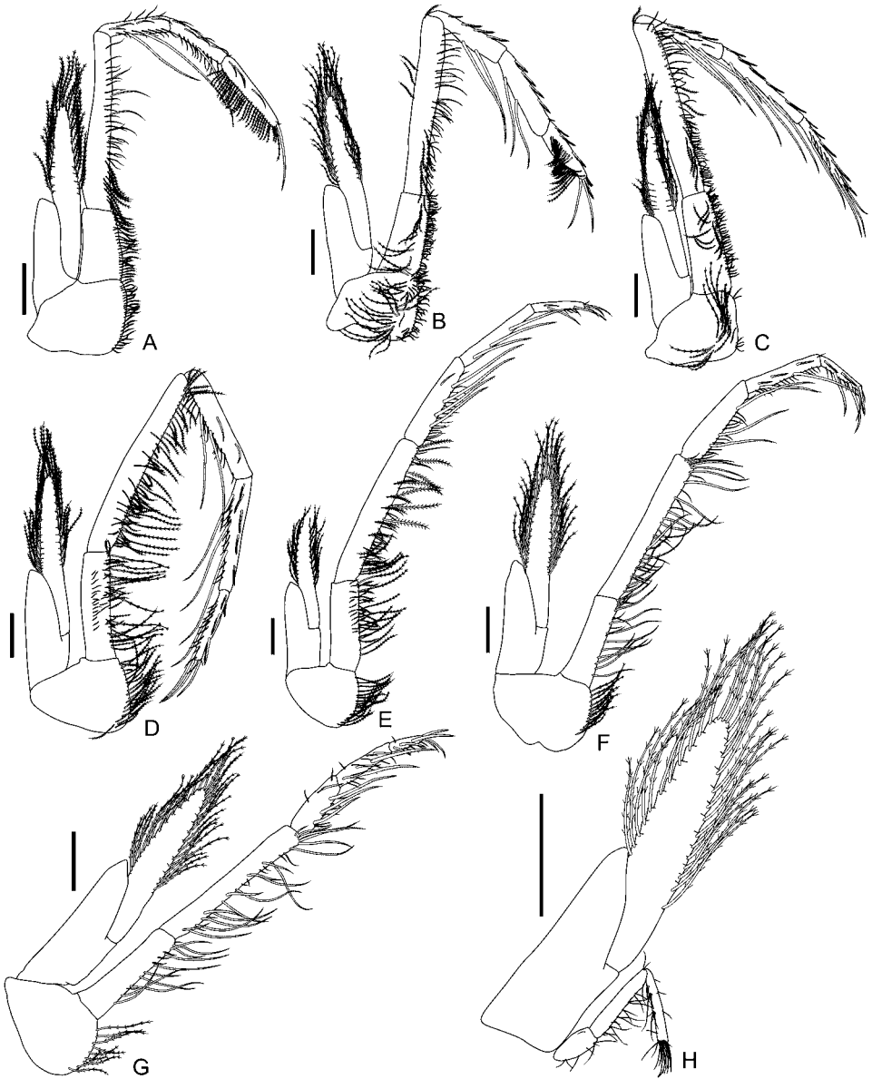
Fig. 2. Thysanopoda cristata G. O. Sars, 1883, (MOUFPE 20050). Female, 67.8 mm in length: A-H, thoracopods 1-8, respectively. Scale bars = 0.05 mm.