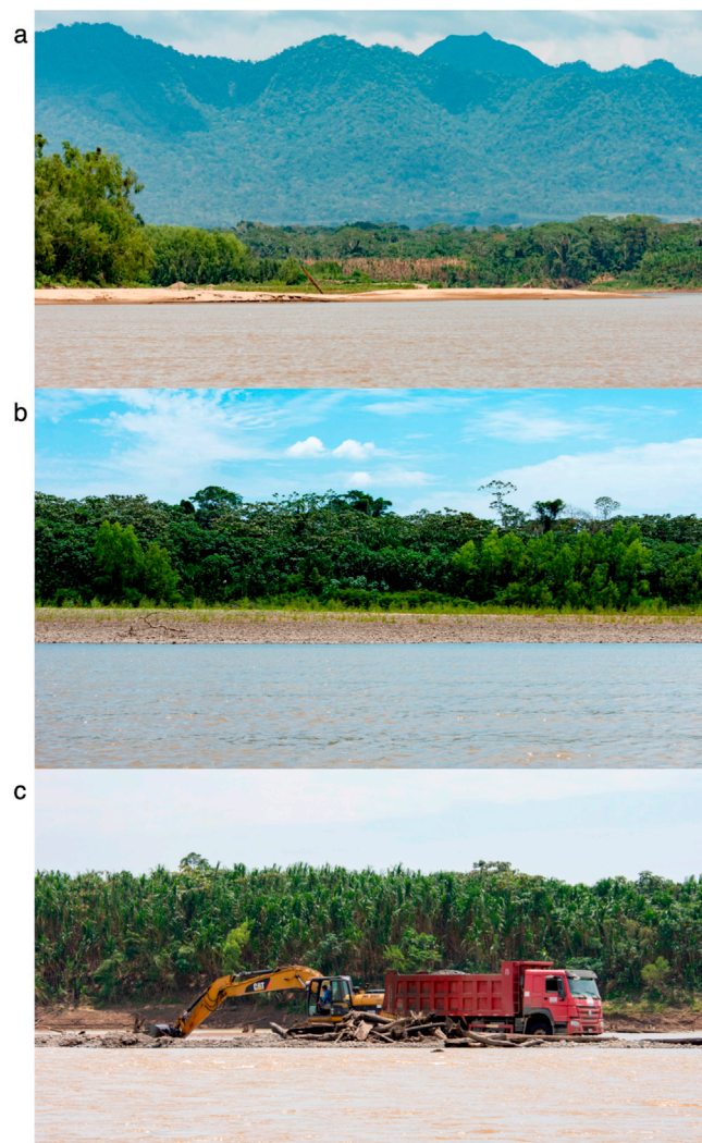
Fig. 2. Ecological transition close to the sampling point (67.5555 W, 14.3329 S) between sand beaches (a), and stone beaches (b). Extraction activity 10 km upstream from the sampling point, at the spawning area, showing the machinery (c) used for extracting gravel for construction materials.