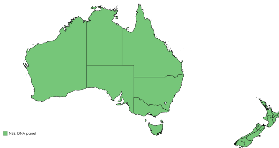
Figure 1. (a) In Europe, (b) in North America, (c) in South America, (d) in Australia and New Zealand. Newborn screening programs for cystic fibrosis (CF) according to the place of DNA analysis. NBS, newborn screening; EGA, extended CFTR genetic analysis.

Numerous programs have included a safety net protocol with the aim to identify CF infants who would be missed by testing variant panels because they carry two rare variants. Depending on the program, neonates with no variant but ultra-high IRT undergo either a second IRT measurement at 14–21 days or a direct sweat testing. In Denmark and the Netherlands, the safety net protocol leads to performing EGA. Safety net protocols lead to limiting false negatives cases, hence increasing the sensitivity of NBS programs, which is particularly effective in ethnic minority communities.