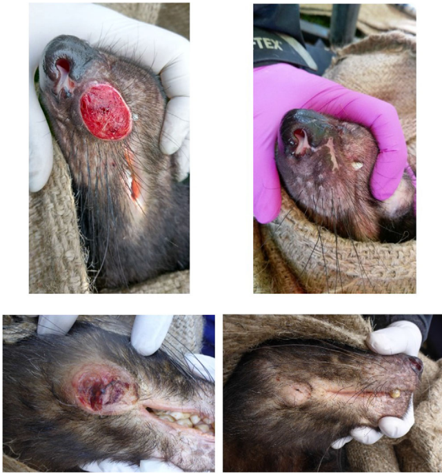
Figure 1. Two wild Tasmanian devils with DFTD (left) and after natural tumor regression 3 months later (right).

rescue (Grueber et al. 2019) are being tested, as are field immunizations aimed at stimulating an adaptive immune response (Pye et al. 2018). However, the epidemiological and evolutionary consequences of introducing naïve individuals from insurance populations into diseased populations have not been evaluated comprehensively, thus, current management is unlikely to prevent transmission. Darwinian principles, host-pathogen coevolutionary theory, and the growing literature on ecological and evolutionary principles in oncology (Korolev et al. 2014) suggest that silver bullets are unlikely to result in disease eradication. We considered evolutionary biology and ecology of host-pathogen interactions to highlight why the role of natural selection in host adaptations to cancer should be considered in the management of this species and other epizootics.