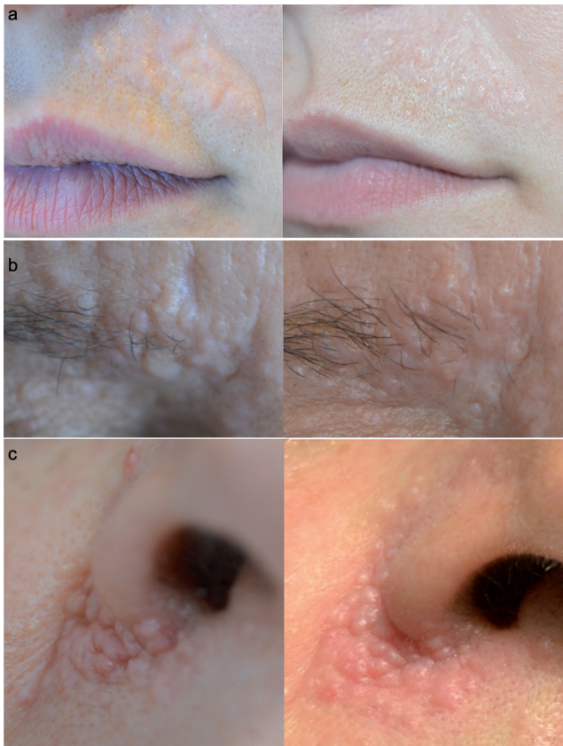
Fig. 2. Multiple trichoepitheliomas localized on (a) nasolabial folds (patient 4), (b) forehead (patient 1) and (c) ala of the nose (patient 3). Evaluation before the start of rapamycin (left), and 5 months of treatment (right).

(2–4 mm), facial trichoepitheliomas, twice daily, alone or after ablative CO 2 laser therapy, for a period of 7 and 12 months, respectively. Treatment was well tolerated and resulted in an interruption of the progression of the lesions, according to the authors. However, no evaluation score was provided. In line with this report, our results suggest that a topical formulation of rapamycin may reduce the thickness and size of trichoepitheliomas and reduce the occurrence of new tumours. However, the overall effect remains limited. This may be explained by incomplete penetration related to galenic formulation or by significant tumour thickness. Efficacy might therefore be optimized by occlusion, adjunction of a solubilizer agent in the formulation to increase rapamycin bioavailability, use of a more concentrated formulation, or concomitant use of ablative laser to reduce lesions thickness as in the report by Tu & Teng (2). Another reason for the limited efficacy could be that less than one-third of the trichoepitheliomas showed positive staining for mTOR (3). The limited efficacy might also be explained