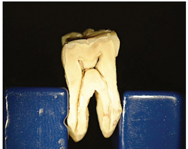
Fig. 1 Image of videoing molar.

The first video concerned simplified endodontic treatment on a molar (►Fig. 1); the second video, precurving of files; the third video, endodontic treatment on a premolar with two distinct camera shots (►Fig. 2); and last, a clinical case highlighting ergonomics, work planning, and successful clinical treatment.