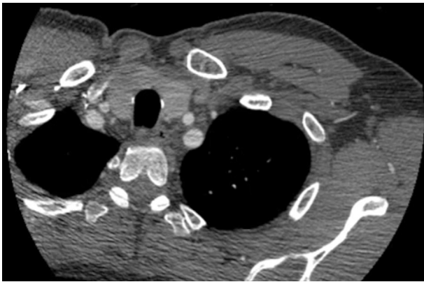
VIDEO 1. Preoperative computed tomography scan of a patient treated for an acute type A aortic dissection using total arch replacement with the frozen elephant trunk technique showing distal false lumen patency with true lumen narrowed by the false lumen. Video available at: https://www.jtcvs.org/article/S0022-5223(18)32783-1/fulltext .

within the descending thoracoabdominal aorta. Indication for the STABILISE procedure was persisting false lumen patency within the thoracic descending aorta associated with clinical and CT scan malperfusion symptoms in 13 patients (Video 1) and associated with dissecting aneurism of the descending thoracic aorta >40 mm in 3 patients. In all patients large intimal tears were seen on the flap distally to the aortic segment repair within the descending thoracic aorta.