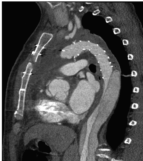
FIGURE 1. Preoperative computed tomography scan of a patient treated for an acute type A aortic dissection using total arch replacement with the frozen elephant trunk technique showing distal false lumen patency with true lumen narrowed by the false lumen.

All procedures were performed using general anesthesia. All of the procedures but one were performed in a hybrid operating suite. The femoral artery side of insertion depended on the extension of the dissection within the aortic bifurcation and the iliac arteries and the side with the easier access to the true lumen was chosen. The operative technique was similar to that previously described for patients with acute type B aortic dissection. 16,17