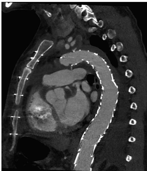
FIGURE 3. Two years postoperative computed tomography scan of the same patient in Figure 1 showing complete remodeling of the thoracoabdominal aorta.

At last CT scan, all of the patients had complete aortic remodeling at the stent graft level with complete false lumen thrombosis and cicatrization (Figure 3, Video 2). At the bare stent level 14 patients (94%) had complete aortic remodeling and cicatrization. One patient had a remaining short segment of patent false lumen at the visceral level due to incomplete bare stent deployment to the external aortic wall: no enlargement was seen at 12 months at this level