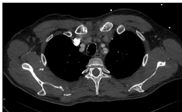
VIDEO 2. Postoperative computed tomography scan showing complete remodeling of the thoracoabdominal aorta. Video available at: https://www.jtcvs.org/article/S0022-5223(18)32783-1/fulltext .