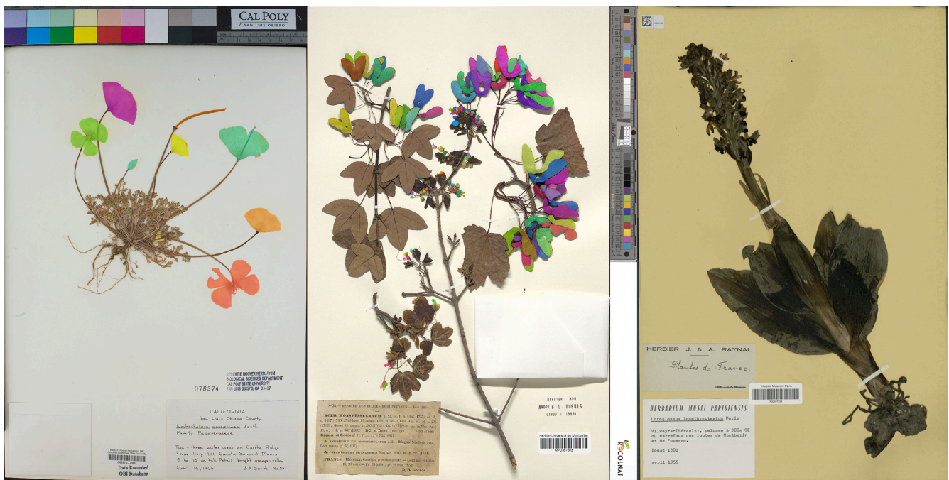
Figure 2. Examples of herbarium specimens displaying visual heterogeneity (e.g., in morphology, labels, and color standards) and challenges related to the morphology and position of reproductive structures. The specimen on the left shows large, isolated reproductive structures that would likely be annotated successfully by ML algorithms. The specimen in the center with small flowers and numerous overlapping fruits would be much more difficult for ML algorithms to parse. The specimen on the right would be very difficult for ML algorithms to delineate or count because of the unclear distinction between flowers and buds. Examples of segmentation masks (see the glossary in box 1) created to delineate reproductive structures are shown by the brightly colored areas in the left and center specimen images.

worldwide are not digitized. Continued digitization of herbarium specimens is needed, particularly of phylogenetically and morphologically diverse collections that can reflect visual variation among specimens and therefore enable the creation of more versatile training data sets.