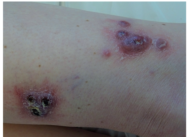
Fig. 1. Multiple purplish ulcerated nodular lesions on the left thigh.

Epstein-Barr virus-related mucocutaneous ulcer (EBV+MCU) is a rare and recently individualized type of EBV-induced B-cell lymphoproliferative disorder, most often linked to immunosuppression. It presents mainly as unique or few mucosal and/or cutaneous ulceration(s), initially reported with an indolent, usually self-resolving course unlike other EBV-driven lymphoproliferative conditions. However, more recent reports emphasized its possible clinical heterogeneity, including multisite lesions along with a relatively more aggressive outcome in some cases. We hereby report a further observation of this rare disease that might enlarge its clinical spectrum owing to an unprecedented pattern of atypical and disseminated lesions.