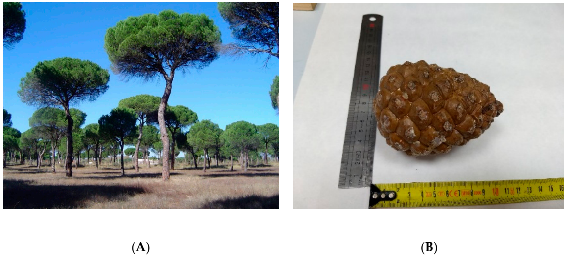
Figure 1. Stone pine tree under management for cone production (A) and size of a stone pinecone (B).