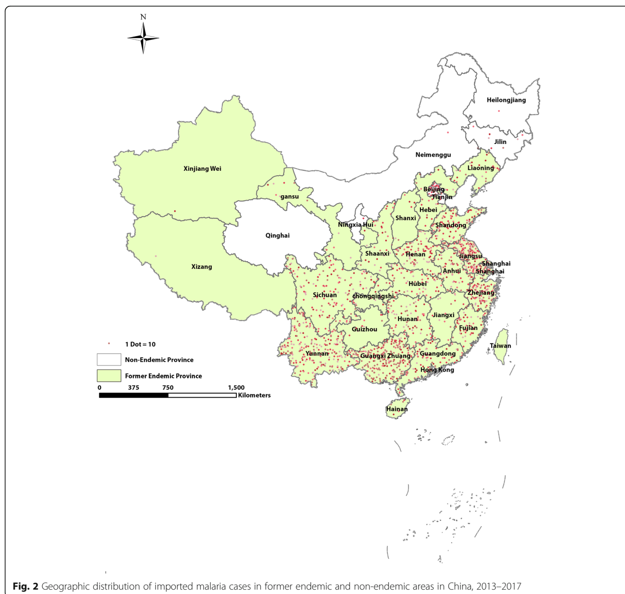
Fig. 2 Geographic distribution of imported malaria cases in former endemic and non-endemic areas in China, 2013–2017

Workers from former endemic areas are exposed to the same conditions in Africa as workers from former non-endemic areas. An explanation might be that the typology of work for travelers differs between those coming from former endemic and former non-endemic areas, more outdoor workers coming from the former and more inside workers coming from the latter. Another main difference can be observed. In former non-endemic areas patients are almost exclusively traveling to Africa (94%) whereas in former endemic areas only 80% are working in Africa and 19% are working in Southeast/South Asia. The most plausible reason for this difference is that some of former endemic areas are located along the Southern Chinese border and have thus established partnership with Southeast/South Asian countries with a