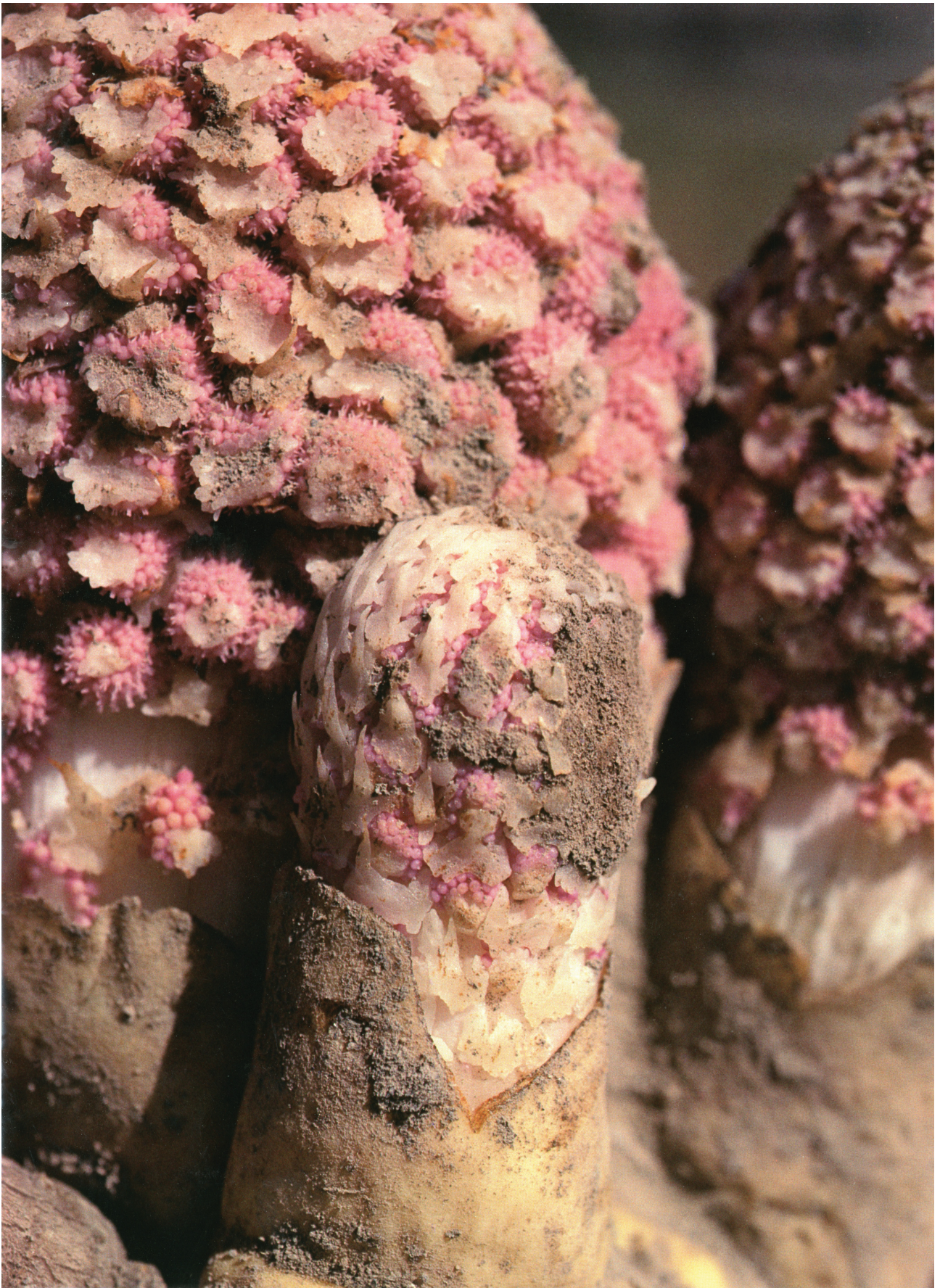
FIGURE 3. Inflorescences of Ombrophytum chilensis , from Murata (1997). Photograph by J.D. Mauseth (near Chiu Chiu, Chile), reproduced with permission.