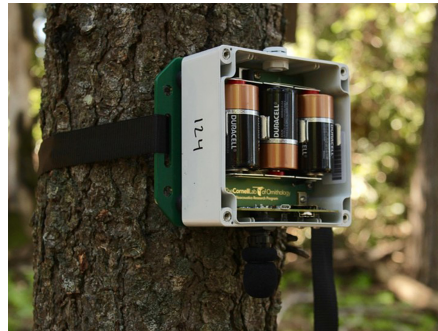
(b) SWIFT recorder in the field

Fig. 2: Autonomous recording units are a widely used sampling tool in ecological research. The SWIFT recorder provided by the Bioacoustics Research Program (BRP) of the Cornell Lab of Ornithology allows to record up to 30 consecutive days of audio. Optimizing the assembly of these weatherproof recorders reduces the costs per unit significantly.