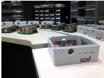
(a) SWIFT recorder assembly line