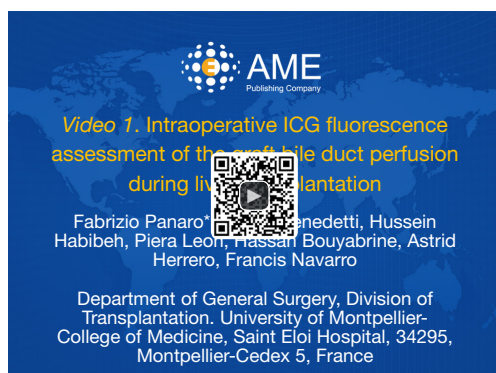
Figure 1 Intraoperative ICG fluorescence assessment of the graft bile duct perfusion during liver transplantation (7). ICG, indocyanine green. Available online: http://www.asvide.com/article/view/25317