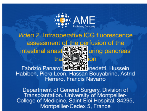
Figure 3 Intraoperative ICG fluorescence assessment of the perfusion of the intestinal anastomosis during pancreas transplantation (8). ICG, indocyanine green. Available online: http://www.asvide.com/article/view/25319

lateral portions previously resected using a linear stapler (Figures 3,4). We could evaluate, furthermore, the vascularization of the head of the pancreas and the site of the anastomoses between the graft duodenal stump and the recipient terminal ileum. We normally perform a side-to-side entero-enteric anastomosis with two running sutures of PDS 4/0. The patient receives a therapeutic dose of intravenous heparin for the first week after transplantation.