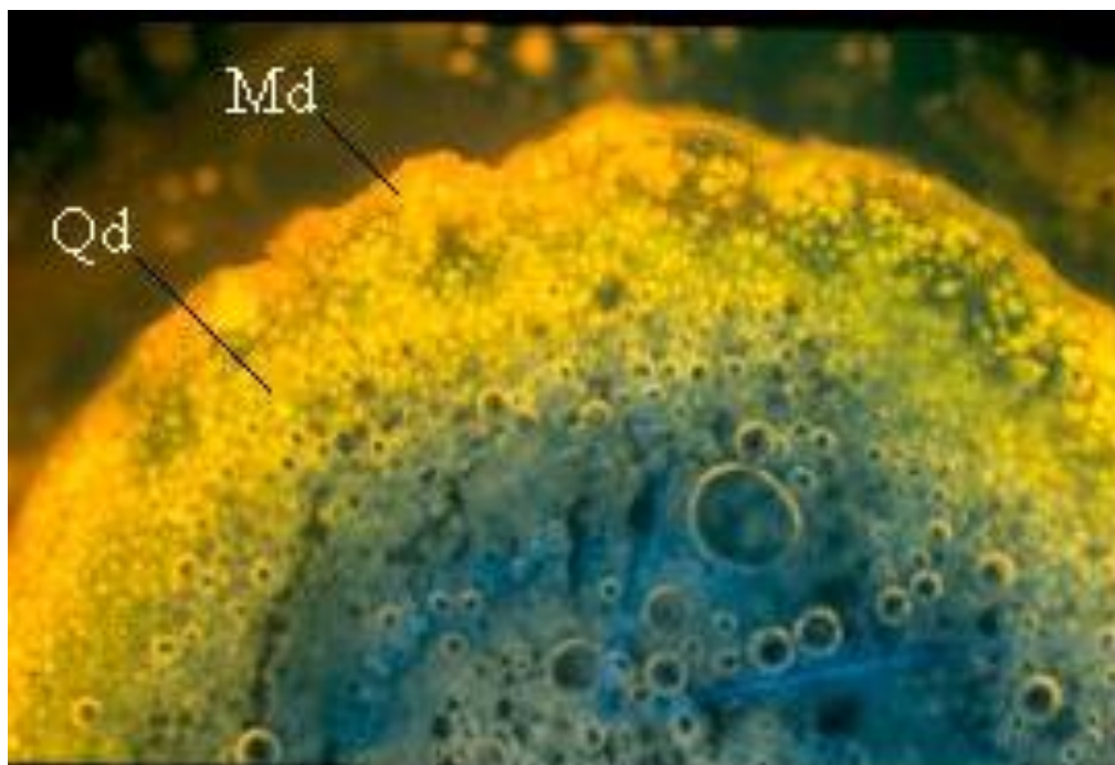
Figure 2 : The histochemical study from the stem of A. spinosa showed a high content of myricetin derivatives (Md) in the peripheral tissues. Qd : Quercetin derivatives.