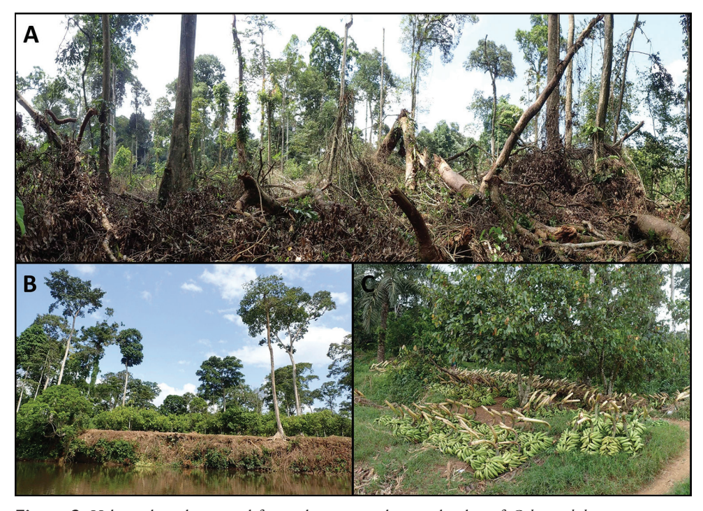
Figure 2. Habitat degradation and forest clearance at the type locality of Calyptrochilum aurantiacum (Mungo River Forest Reserve). In less than 10 years, hundreds of hectares of mature lowland rainforest have been converted to cocoa plantations along the Mungo River (pers. comm. by local communities). A Freshly cleared forest where plantain and bananas will be cultivated during two years prior to being replaced by cocoa trees. B A ten-year old cocoa plantation on the banks of the Mungo River; only a few shade trees remain from the original forest. C Plantain and banana bunches that are harvested every day along the Mungo River. Photographs by V. Droissart (June 2017).

m above the ground on the lower branches of a primary forest tree (van der Laan and Cribb 1986). In 2017, we collected the species near the type locality on Desbordesia glaucescens (Irvingiaceae) and Scottellia sp. (Achariaceae) that had recently been felled to establish a new cocoa and banana plantation (Figure 2). In the same locality, the species was also collected on kola and cocoa trees in a 7-year old cocoa plantation. Within and around the Banyang-Mbo Wildlife Sanctuary, it was collected in the canopy of large trees (i.e. Duguetia staudtii (Engl. & Diels) Chatrou (Annonaceae) and Klainedoxa gabonensis (Pierre ex Engl.) (Irvingiaceae)).