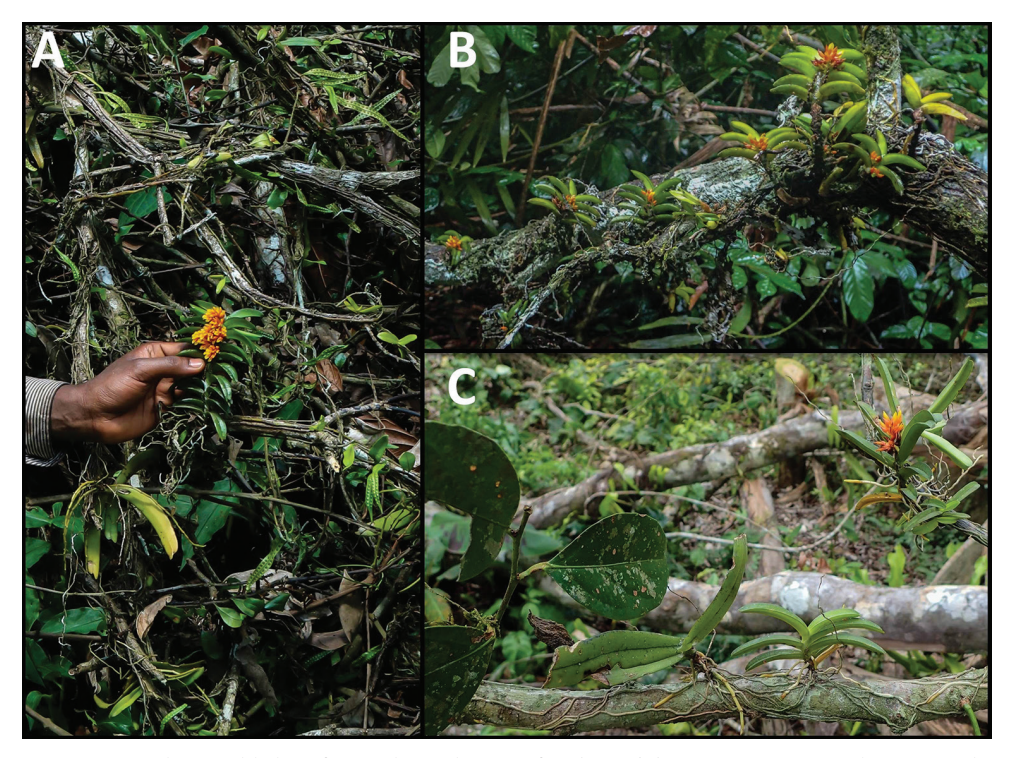
Figure 3. Ecology and habit of natural populations of Calyptrochilum aurantiacum . A Flowering individual growing on upper branches of a felled kola tree, along with the angraecoid orchid Diaphananthe plehniana and the fern Microgramma owariensis . B Dense population growing on 1 metre long branches of Duguetia staudtii . C Calyptrochilum aurantiacum and Diaphananthe plehniana growing side by side on Salacia sp. (Celastraceae). Photographs by V. Droissart (June 2017).

graecum Bory sect. Pectinaria (Benth.) Schltr. (Simo-Droissart et al. 2018b) and to transfer Ossiculum aurantiacum to Calyptrochilum.