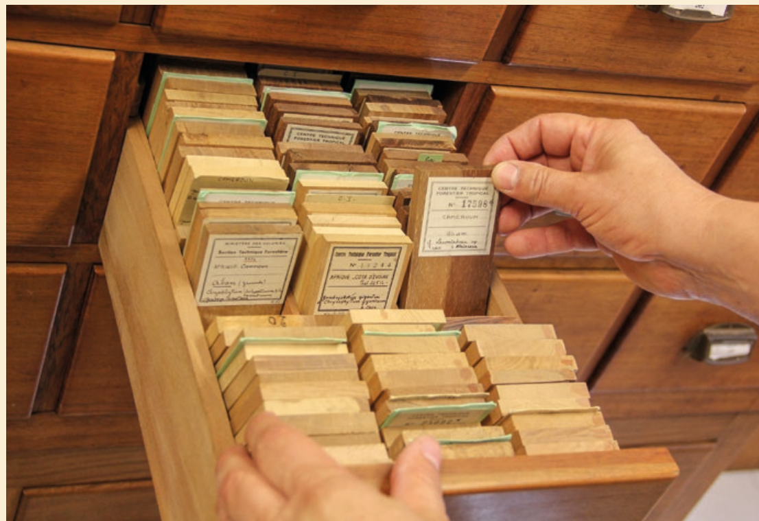
Image of the wood collection (Xylotheque): open drawer with 3 rows of specimens.

Auteur correspondant / Corresponding author: Bernard Thibaut – bernard.thibaut@umontpellier.fr