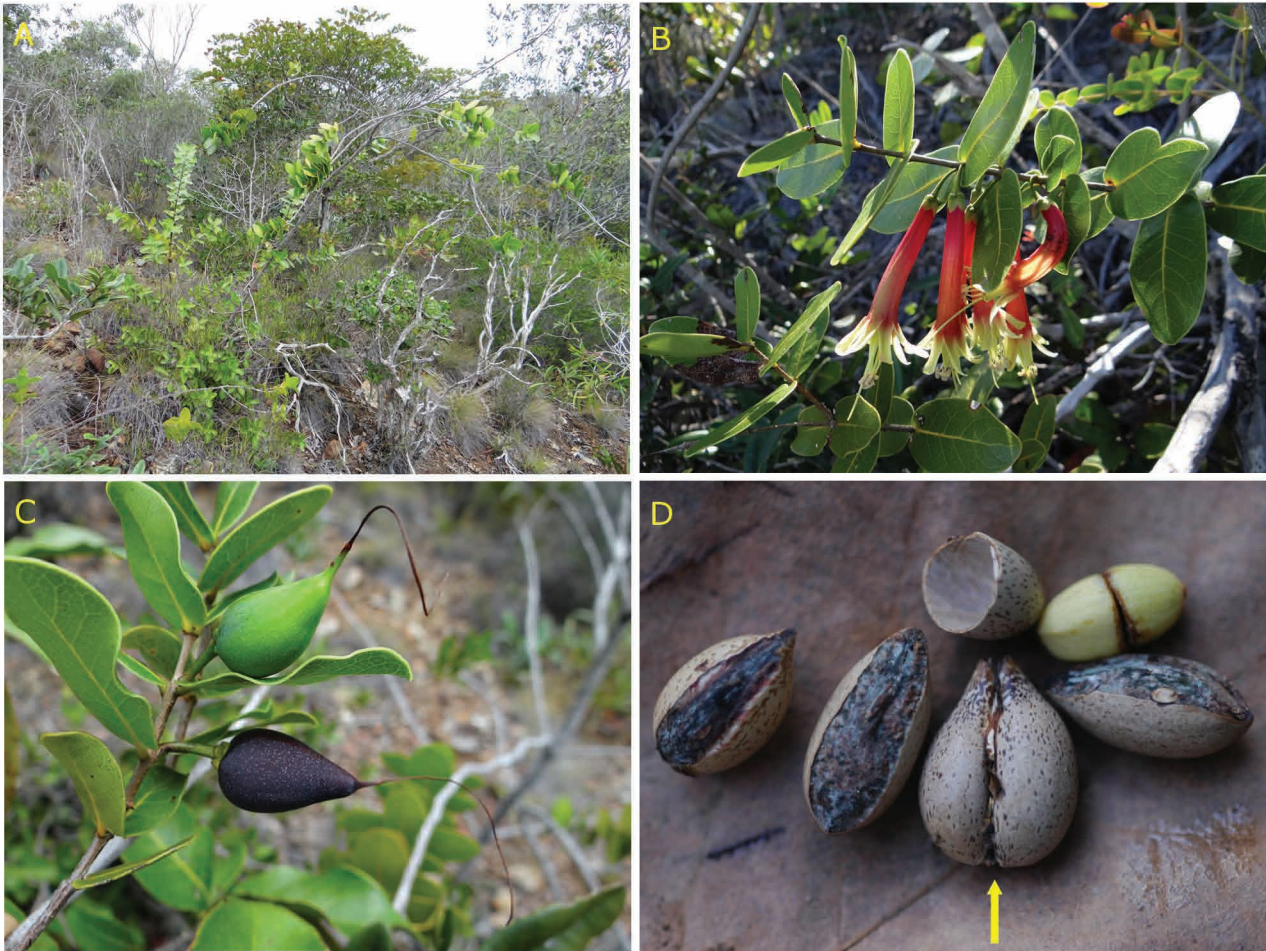
FIGURE 1. Pycnandra longiflora , A. Habit of open maquis, B. Flowering branch, C. Fruits with long persistent styles, D. Seeds from one- or two-seeded (arrow) fruits.

Pycnandra longiflora (Benth.) Munzinger & Swenson, Austral. Syst. Bot. 28: 101 (2015) (Fig. 1)