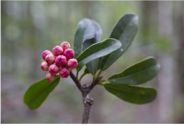
FIGURE 1 Flowering stem of Symphonia globulifera (Clusiaceae), one of the 704 tree species identified in the Piste St Elie long-term research plot, located in the tropical rain forest of French Guiana. This species has at least one congener in the study plot, as 80% of the species, and its seeds are dispersed by animals, as 87% of the species.

it is now well established that the genetic diversity of dominant species can feed back on the whole community (Bolnick et al., 2011; Crutsinger et al., 2006). Hence, a full analysis of community structure should integrate functional and phylogenetic intraspecific and interspecific components (Bolnick et al., 2011; Pavoine & Izsák, 2014). Whereas a few population genetic studies have sampled and analyzed multiple species simultaneously (Petit et al., 2003; Taberlet et al., 2012), they have not focused on the genetic diversity of entire communities. Performing such a study would provide a unique opportunity to investigate shared genetic variation across species and clarify its origin. It could also help identify new avenues to understand the evolution of communities.