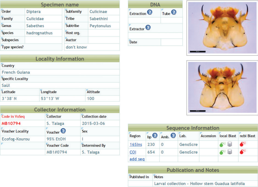
Figure 3. Sample data entry of our online database ( http://mosquitoes.ups-tlse.fr with restricted access) holding the “Mosquitoes of French Guiana” dataset.

Sabethes hadrognathus Harbach, 1995 authority from EOL