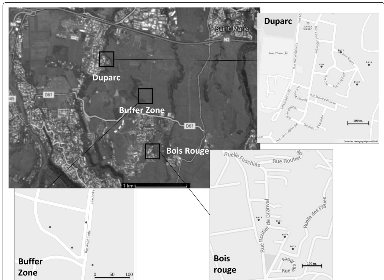
Fig. 2 Localisation of the three collection areas: two urban pilot sites, Duparc and Bois Rouge, and the uninhabited buffer zone. Dots indicate the position of the four types of traps at each collection site

here as the theoretical expectation if the same proportion of mosquitoes was caught in each trap (such as a 1:1:1:1 ratio for the type of trap or a 1:1:1 ratio for the 3 weeks of collection or the different collection sites). For the post-hoc test, we determined which categories were significantly different from their null hypothesis by testing each category vs the sum of all categories, with the Bonferroni correction.