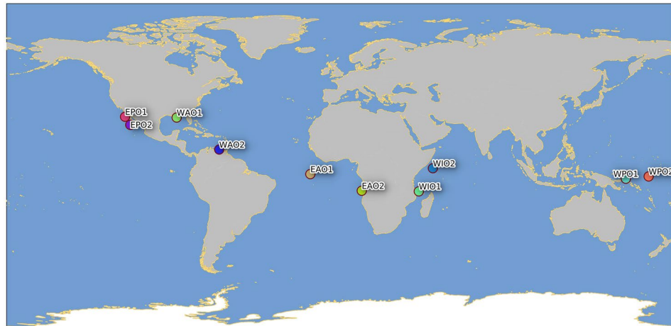
Figure 1. Map of the sampling locations of Thunnus albacares . Samples are given as in Table 1. This figure was produced using QGIS.