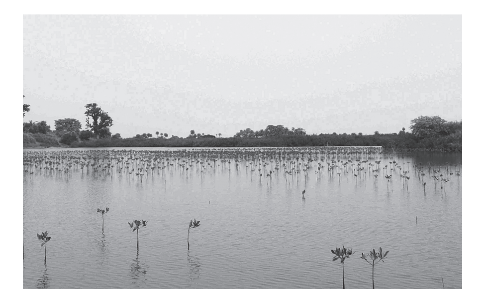
Figure 2: Example of unsuccessful reforestation in the Saloum Delta in 2013