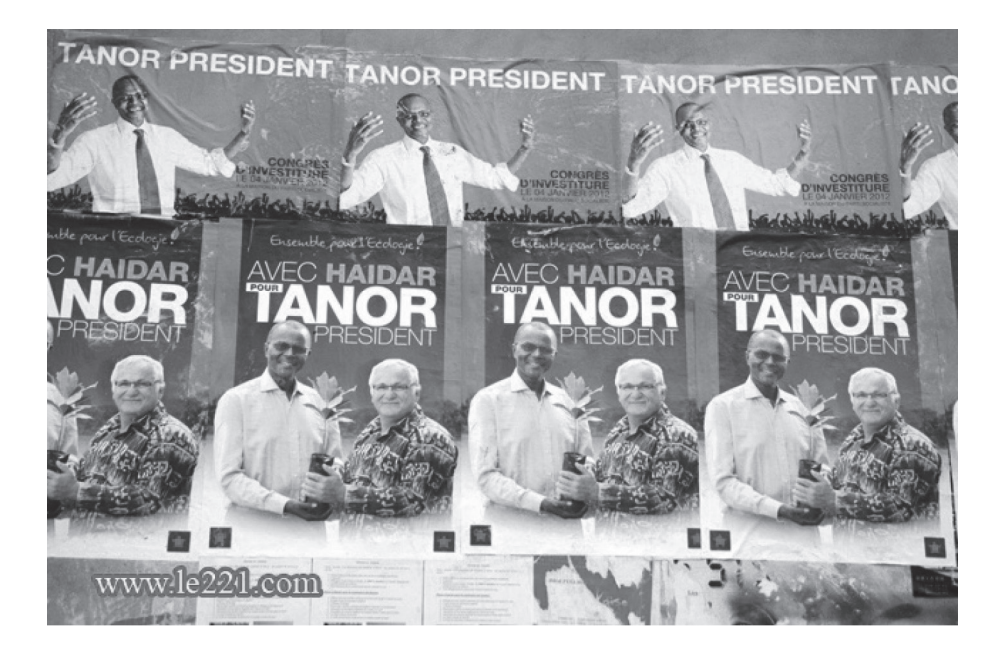
Figure 3: Poster campaign of one candidate to the Senegalese presidency in 2012

The trade-off between services is a major issue that has been insufficiently studied. For example, shellfish gathering (Saloum Delta), small-scale aquaculture and fisheries could be negatively affected resulting in environmental injustice (Schlosberg 2007), as could the limitation of alternatives such as rice cultivation. Who are the ultimate beneficiaries of the reforestation? Are they the traditional users, the public institutions or the private companies? The boundaries between green washing and land grabbing seem unclear, to say the least.