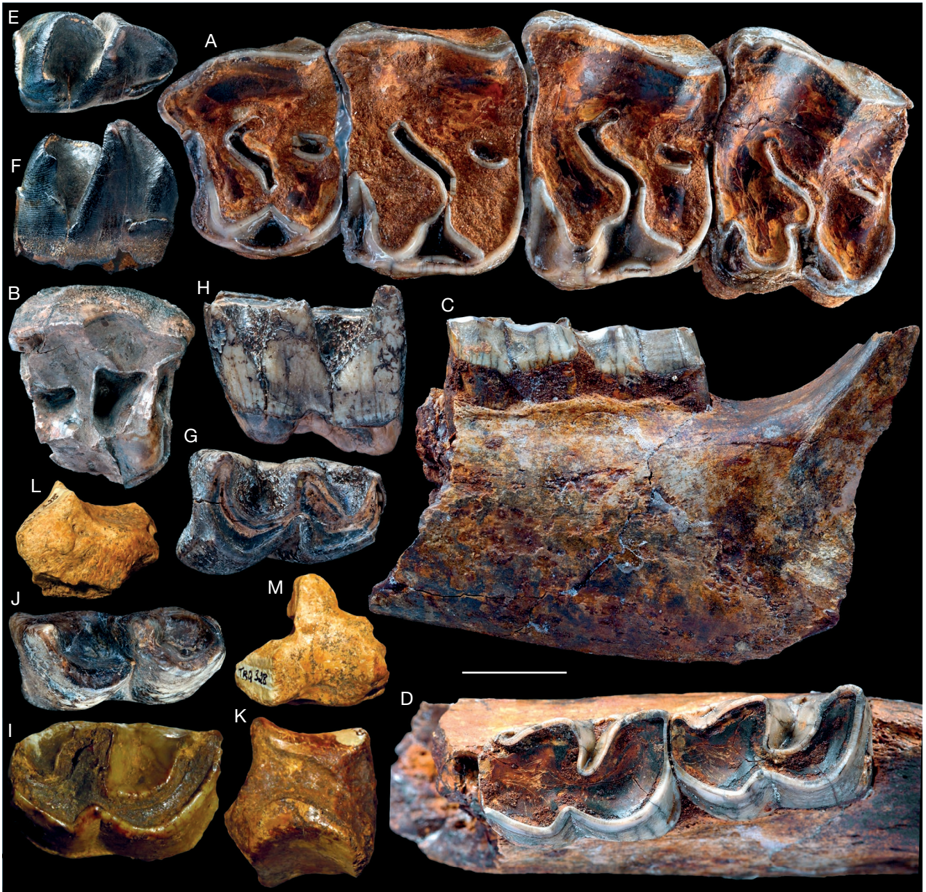
Fig. 3. — Tapiromorph perissodactyls from the upper Miocene locality of Küçükçekmece, Thrace, Turkey, Persiatherium sp.: A , KÇ318, left P2-M1 series in occlusal view; B , KÇ300, right P2 in occlusal view; C , D , KÇ360, left dentary with m2-m3 in labial ( C ) and occlusal views ( D ); E , F , KÇ296, left p2 (germ) in occlusal ( E ) and lingual views ( F ); G , H , KÇ301, right p4 in occlusal ( G ) and lingual views ( H ); I , MNHN.F.TRQ356, left m1 in occlusal view; J , KÇ311, right d4 in occlusal view; K , TRQ365, left pyramidal in medial view; L , M , TRQ328, right Mc3 (proximal fragment) in anterior ( L ) and proximal views ( M ). Scale bar: A, B, 20 mm; C, K-M, 30 mm.