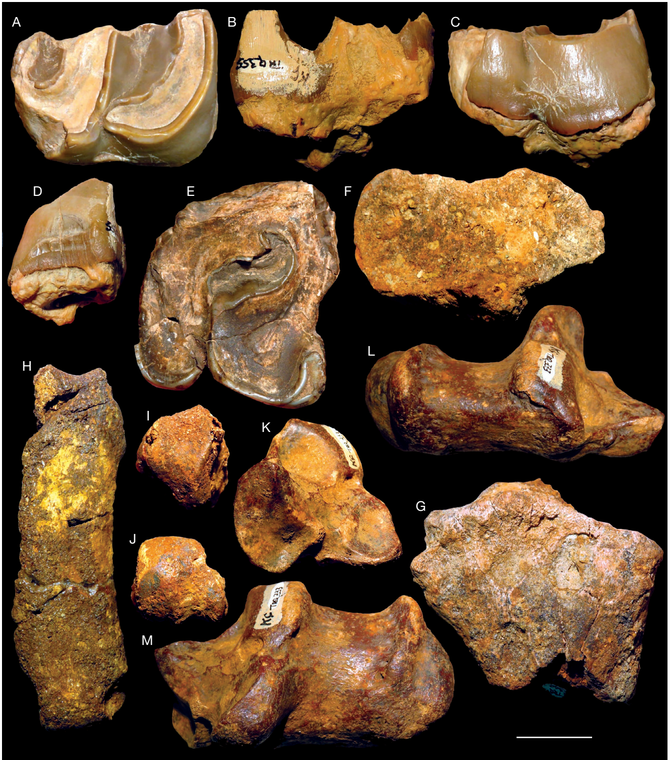
FIG. 1. — Tapiromorph perissodactyls from the upper Miocene locality of Küçükçekmece, Thrace, Turkey: A-D , Ronzotherium sp. (reworked); MNHN.F.TRQ355, left m1 or m2 in occlusal ( A ), lingual ( B ), labial ( C ), and posterior views ( D ); E-M , Ceratherium neumayri ; E , TRQ343, right M1 in occlusal view; F-G , TRQ360, right radius in proximal ( F ) and anterior views ( G ); H-J , TRQ327, right Mc2, in anterior ( H ), proximal ( I ), and distal views ( J ); K-M , TRQ333, right calcaneus, in distal ( K ), anteroproximal ( L ), and medial views ( M ). Scale bar: A-E, 20 mm; F-M, 30 mm.

on the radius, the absence of a trapezium-facet and of a longitudinal crest on the posterior surface of the diaphysis on the Mc2, and the low development of the tuber calcanei on the calcaneus discard any referral of the concerned specimens