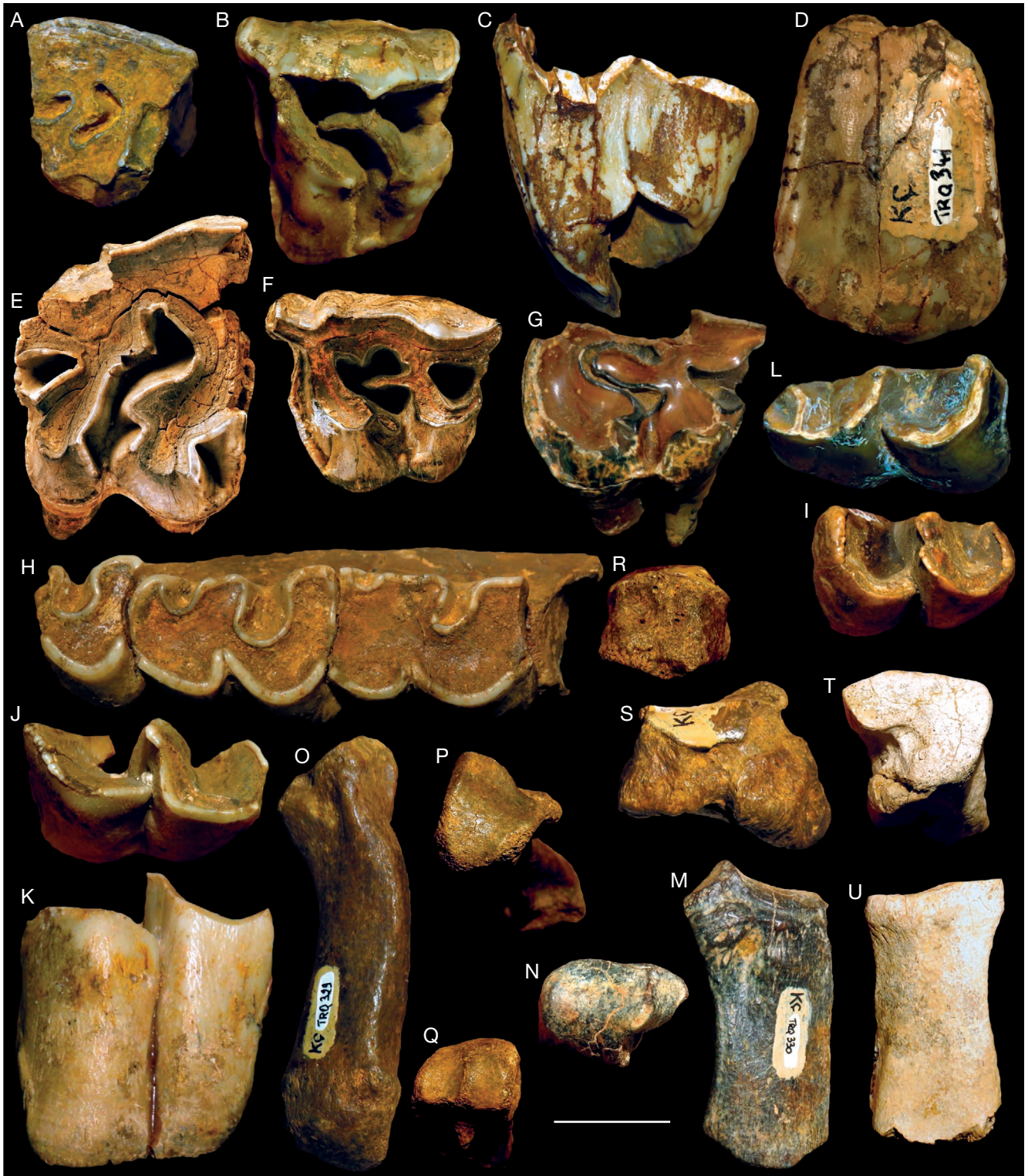
FIG. 2. — Tapiromorph perissodactyls from the upper Miocene locality of Küçükçekmece, Thrace, Turkey. Chilotherium schlosseri (Weber, 1905): A , MNHN.F.TRQ339, right P2 in occlusal view; B-D , TRQ341, left unworn P4 in occlusal ( B ), posterior ( C ), and labial views ( D ); E , KÇ297, right M2 in occlusal view; F , KÇ295, left D3 in occlusal view; G , TRQ346, left D4 in occlusal view; H , TRQ352, left mandible fragment with p3-m1 in occlusal view; I , TRQ353, right p4 (germ) in occlusal view; J-K , TRQ354, right m2 in occlusal ( J ) and labial views ( K ); L , TRQ358, left d3 in occlusal view; M , N , TRQ330, right Mc3 without distal end, in anterior ( M ) and proximal views ( N ); O-Q , TRQ329, right Mc4 in anterior ( O ), proximal ( P ), and distal ( Q ) views, note the presence of a posterodistal tubercle on the diaphysis ( Q ); R , S , TRQ364, left cuboid in anterior ( R ) and lateral views ( S ); T , U , TRQ335, left Mt3 (proximal fragment) in proximal ( T ) and anterior views ( U ). Scale bar: A-L, 20 mm; M-U, 30 mm.

the neck is not easily discernable. It has a straight and cylindrical root, and the tip of the crown is curved, in a similar way to MNHN.F.TRQ348 and TRQ349 (crowns