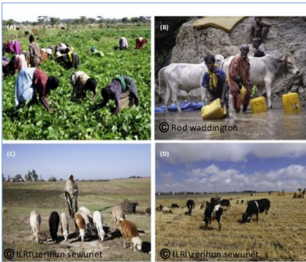
Figure 2 . A Case Study, the Work of Fentie et al. in Ethiopia [19]. Growing vegetables is crucial in the region (A). Irrigation canals are built to irrigate fields, but these canals can also favour fasciolosis transmission because they can be contaminated by animal faeces and are good habitats for freshwater snails. Fields can be contaminated during irrigation, infesting the people who consume raw vegetables or drink unsafe water due to no access to safe water. (B) Local people breed sheep, cattle, or horses. Animals are close to humans. C,D) Domestic animals drink in irrigation canals and rivers, which are also used by humans. Moreover, in this study, the same factors play a role in both fasciolosis and schistosomiasis transmission. This example shows that it is important to consider each risk factor to limit disease emergence. Indeed, the factors described above can be linked to each other. In this case, integrated control can be a good solution for the fight against schistosomiasis and fasciolosis transmission in both humans and livestock

How do we evaluate which socioeconomic and ecological contexts can increase the risk of the emergence of fasciolosis?