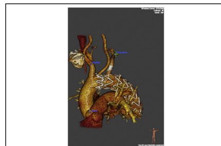
Patients treated with a homemade fenestrated stent-graft for TEVAR of a complicated chronic type B dissection.

Conclusions: The use of a homemade fenestrated stent-graft for thoracic endovascular aortic repair of zone 2 aortic lesions is both feasible and effective for left subclavian artery revascularization during thoracic endovascular aortic repair involving a spectrum of thoracic aortic pathology. Durability concerns will need to be assessed in additional studies with long-term follow-up.