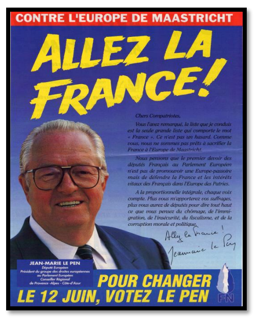
Under J-M Le Pen's pictures, it reads: 'Member of the European parliament, President of the Group of the European Right at the European Parliament, President of the National Front", and in 1994, PACA regional councilor'.