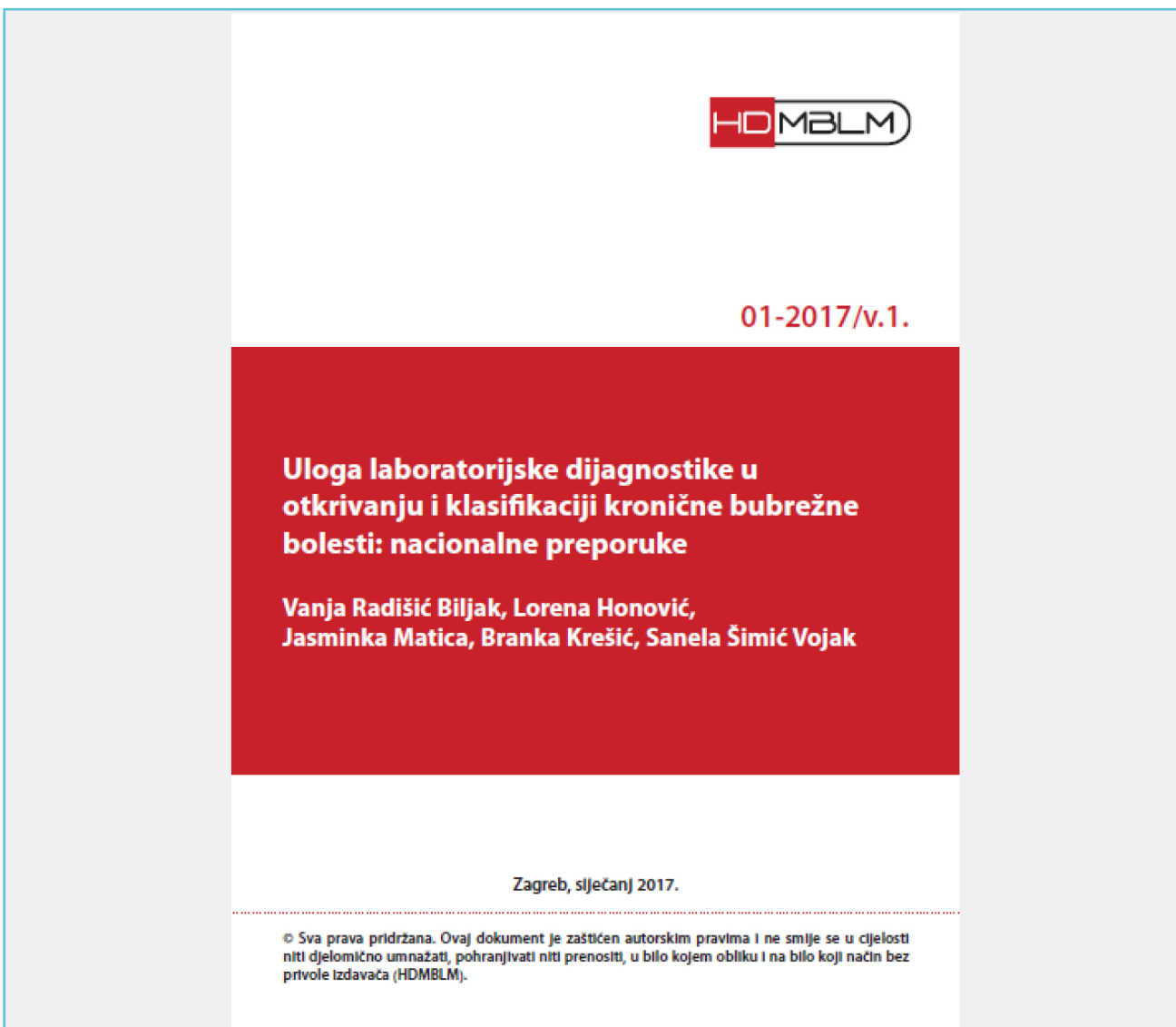
Figure 3 The main page of a Croatian national recommendations for laboratory diagnostics of chronic kidney disease (booklet)

The national recommendations are mainly based on the KDIGO 2012 guidelines, however, novel literature findings are also incorporated. Considering the results obtained via conducted survey, our main goal was to provide recommendations that can be easily applied in every medical biochemistry laboratory in Croatia. We, as a WG and authors of recommendations, decided to start at the basic laboratory tests used in laboratory diagnostics of CKD: creatinine, eGFR, urine albumin-to-creatinine ratio (ACR)