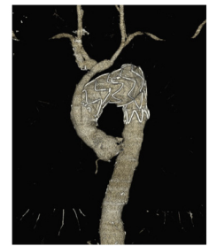
Zone 0 debranching and endovascular repair for dissecting aneurysm of the aortic arch.

still associated with a significant in-hospital mortality rate. 4 Thoracic endovascular aortic repair (TEVAR) offers a less-invasive surgical procedure but requires hybrid surgery that includes the use of open surgical procedures, such as debranching for revascularization of cervical branches to provide an adequate landing zone in different segments of the aortic arch. Hybrid aortic arch repair (HAR) has been reported mainly for degenerative aneurysms, traumatic aortic injuries, or penetrating ulcers of the aortic arch. Few reports currently are available in the literature regarding HAR for chronic dissecting aneurysms,